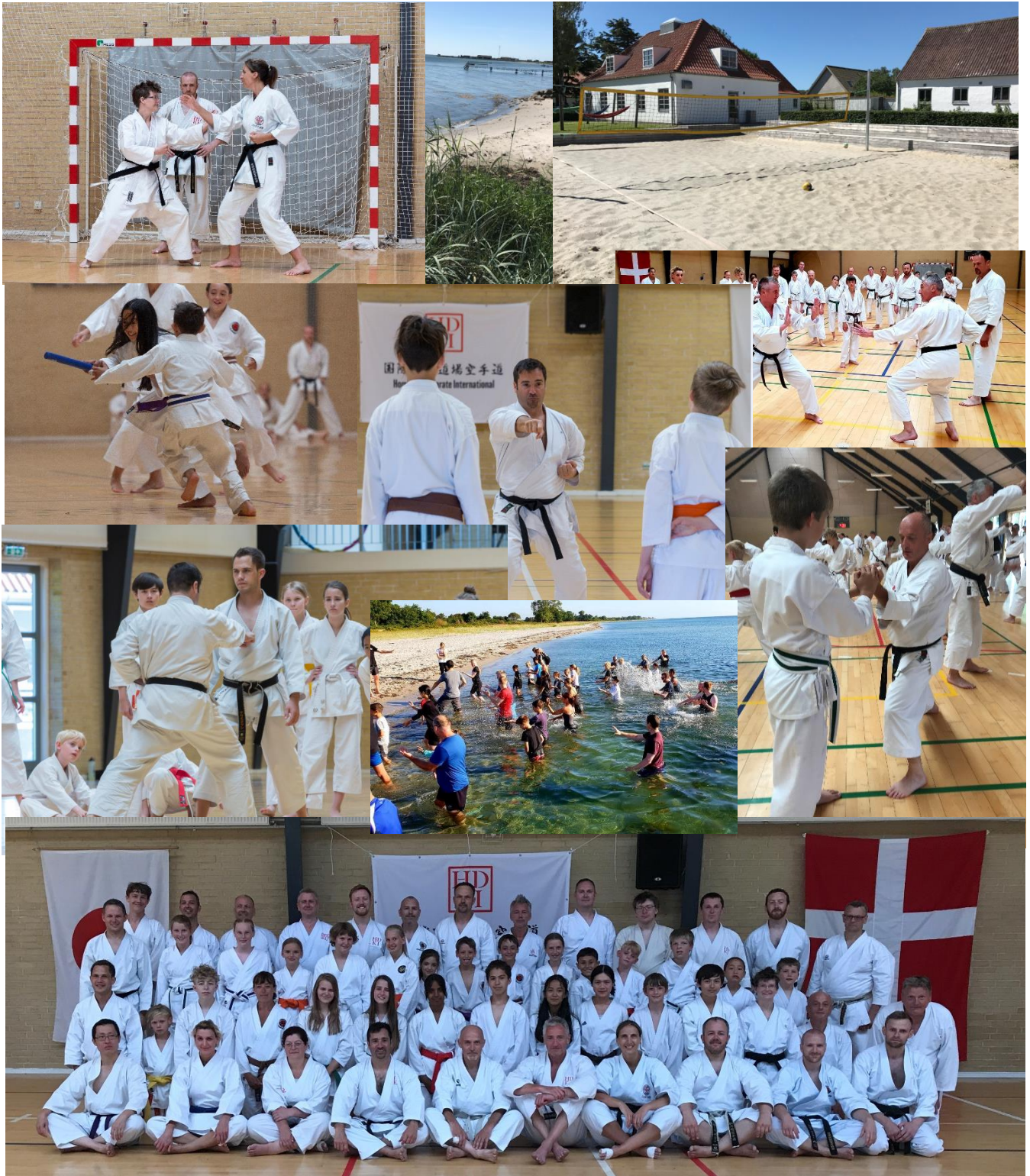
Above: some "memories" from the HDKI Denmark Summer Camp 2017 and 2018.

For more information – or if you have some questions – please contact us at: hdki.denmark@gmail.com